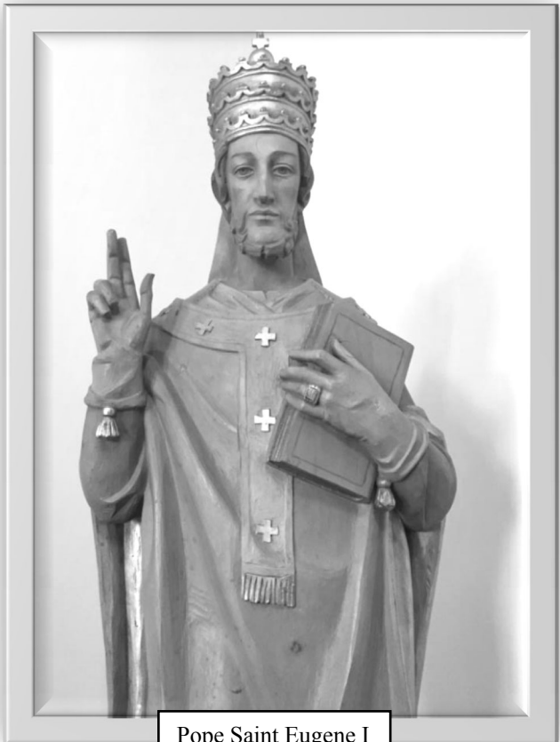
Pope Saint Eugene I