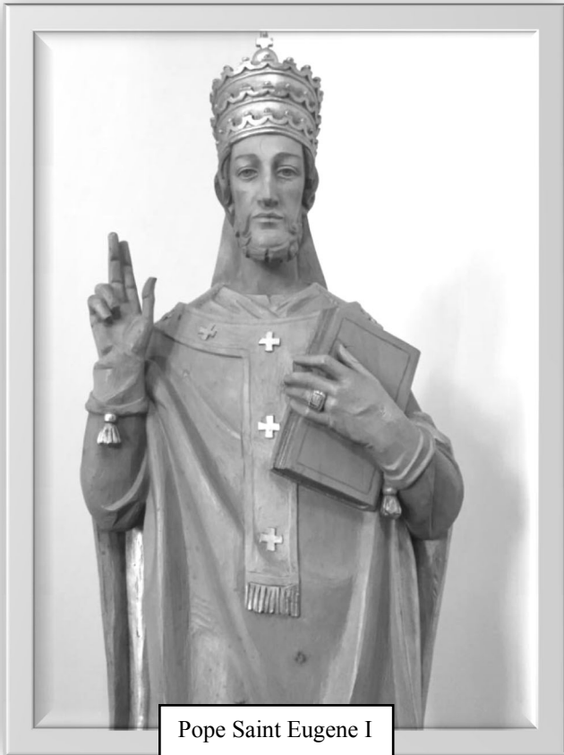
Pope Saint Eugene I