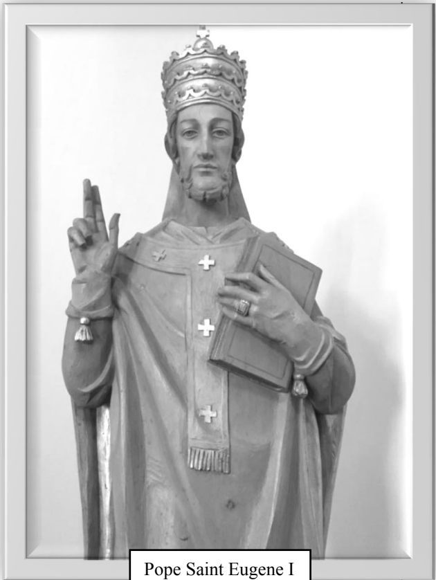
Pope Saint Eugene I