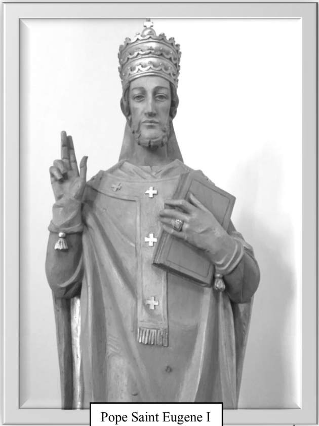
Pope Saint Eugene I