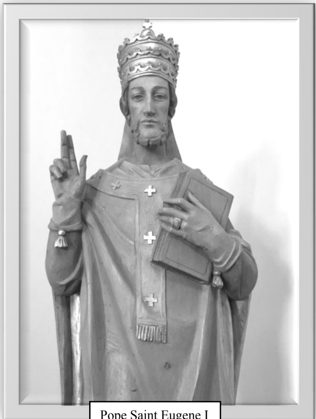
Pope Saint Eugene I