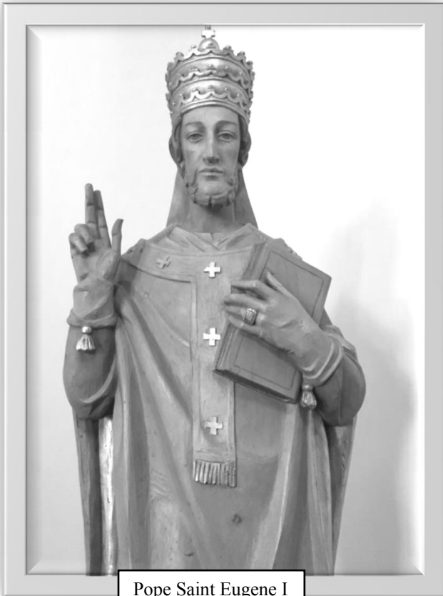
Pope Saint Eugene I

TUCKAHOE ROAD AND CENTRAL PARK AVENUE YONKERS, NEW YORK