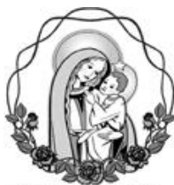
Happy Mother's Day