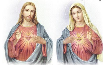
Intercede for Us

On to the What. What made all this possible? "In the sixth month, the angel Gabriel was sent from God to a town of Galilee called Nazareth, to a virgin betrothed to a man named Joseph, of the house of David, and the virgin's name was Mary...Then the angel said to her, 'Do not be afraid, Mary, for you have found favor with God. Behold, you will conceive in your womb and bear a son, and you shall name him Jesus...Mary said, 'Behold, I am the handmaid of the Lord. May it be done to me according to your word.' " (Luke 1:26-27, 30-31, 38) What made all this possible? The sinless soul and devoted heart of our Blessed Lady. A heart filled with such great charity that even though She knows of the divine life within Her womb, She does not glorify Herself... "Mary said: 'My soul proclaims the greatness of the Lord; my spirit rejoices in God my savior. For He has looked upon His handmaid's lowliness; behold, from now on will all ages call me blessed. The Mighty One has done great things for me, and holy is His name.' " (Luke 1:46-49) Because of Her great love, because of Her immaculate heart, the Blessed Virgin Mary, was able to say "Yes" to the Angel Gabriel in words since She had already given Her heart to God.